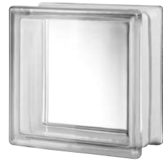
4" PREMIERE™ SERIES